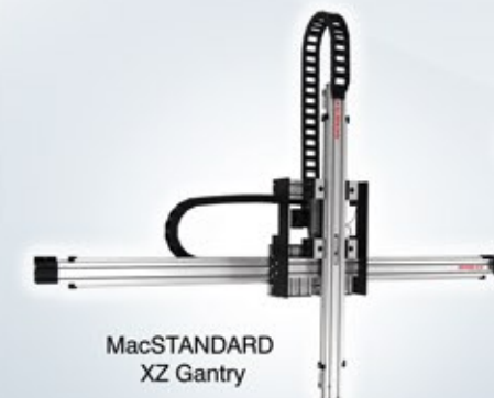
MacSTANDARD XZ Gantry

Our gantry and cartesian systems are available standard or configured to meet your specs. Motor mounting flexibility, cable management solutions, and plug and play functionality are just a few added bonuses to our proven experience in belt and screw driven technology.