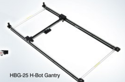
HBG-25 H-Bot Gantry